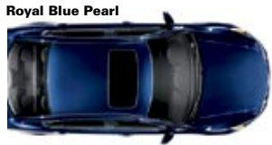
Royal Blue Pearl

No matter what interior trim you choose, you can be sure of one thing: legendary Honda quality. From the materials chosen to the meticulous craftsmanship employed, the inside of the new Accord is designed to retain its new-car look and feel for years to come. As for the outside, the 11 exterior colors are all corrosion-resistant and have been given a tough, durable finish to help preserve your Accord's sleek, glossy appearance.