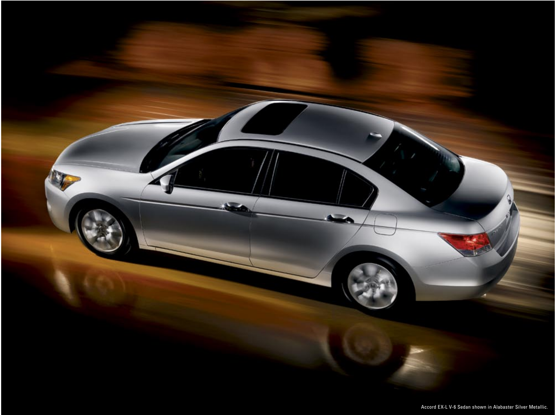
Accord EX-L V-6 Sedan shown in Alabaster Silver Metallic.