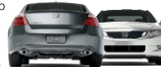
Polished Metal Metallic