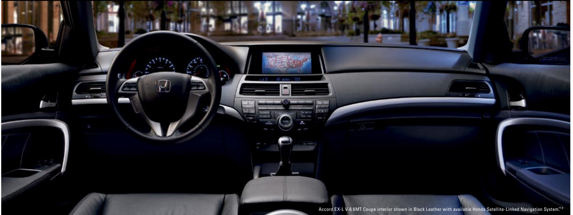
Accord EX-L V-6 6MT Coupe interior shown in Black Leather with available Honda Satellite-Linked Navigation System™ 3

The Accord is designed to be an extremely engaging experience. Equip yours with the Honda Satellite-Linked Navigation System, 3 and you'll command a vast knowledge of the contiguous U.S. It has a huge point-of-interest database, 6 including restaurant ratings and reviews from