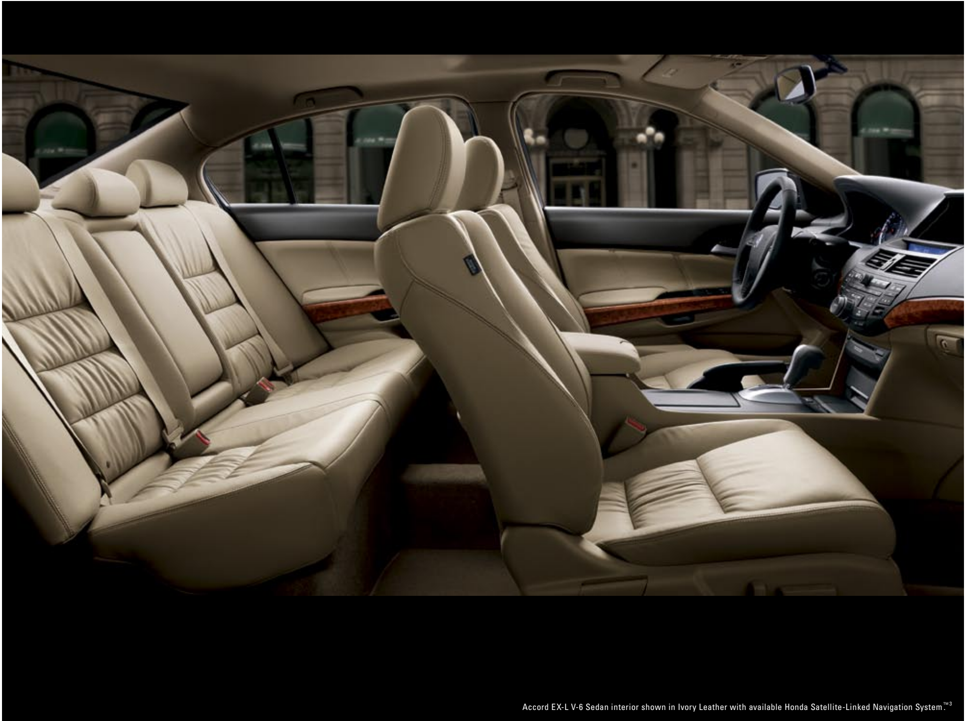
Accord EX-L V-6 Sedan interior shown in Ivory Leather with available Honda Satellite-Linked Navigation System. TM3