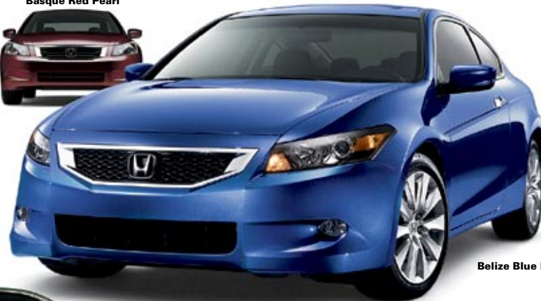
Belize Blue Pearl