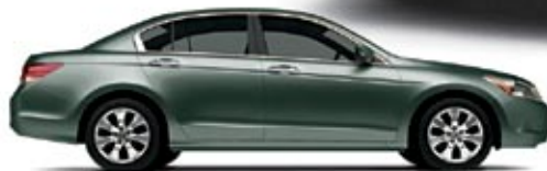
Mystic Green Metallic