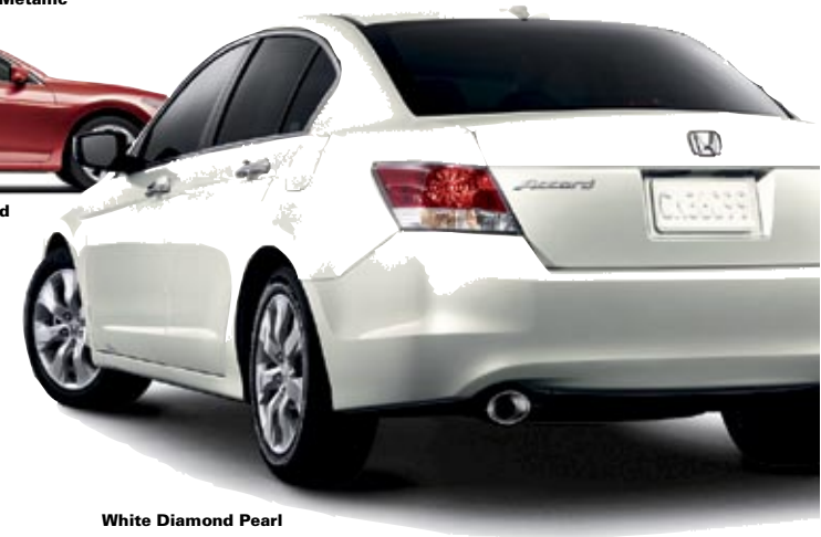
White Diamond Pearl