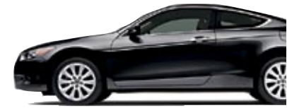
Nighthawk Black Pearl