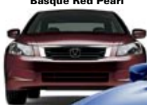
Basque Red Pearl