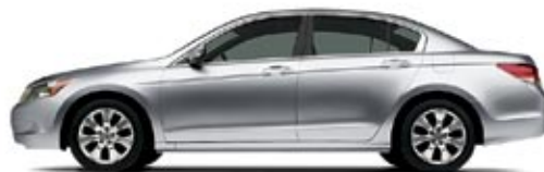
Alabaster Silver Metallic