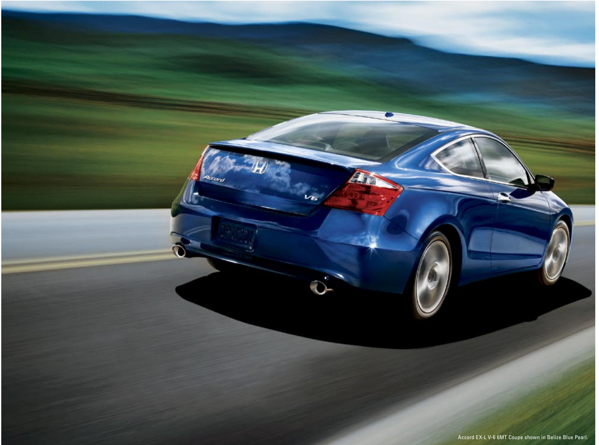
Accord EX-L V-6 6MT Coupe shown in Belize Blue Pearl.