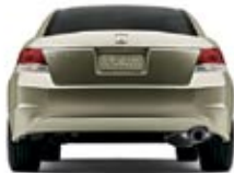
Bold Beige Metallic