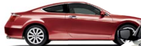
San Marino Red