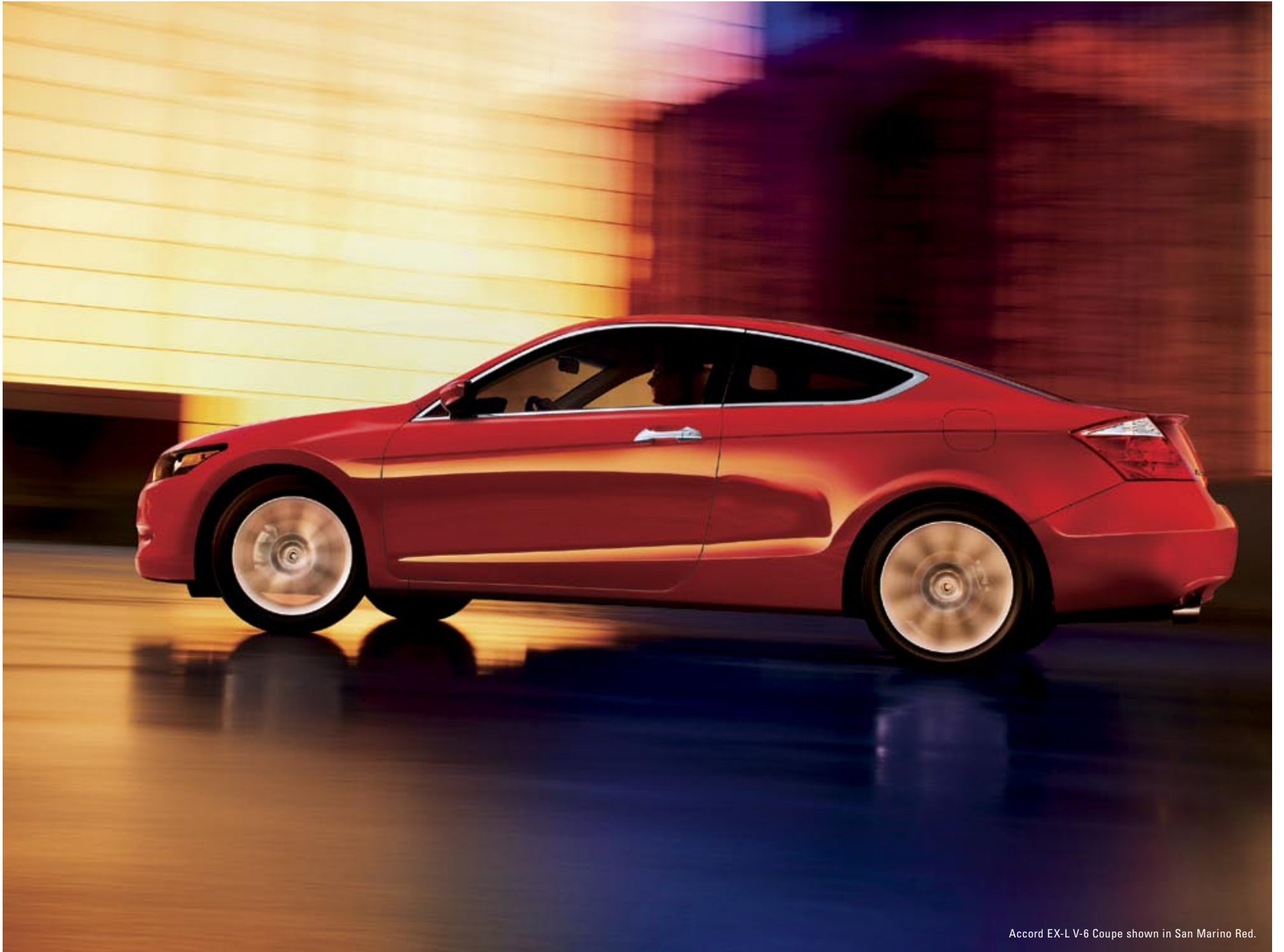
Accord EX-L V-6 Coupe shown in San Marino Red.