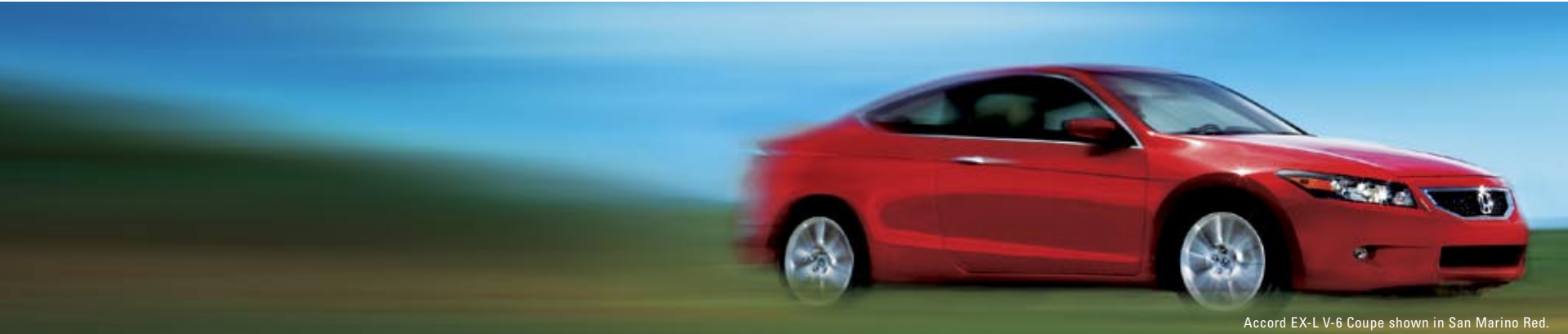
Accord EX-L V-6 Coupe shown in San Marino Red.