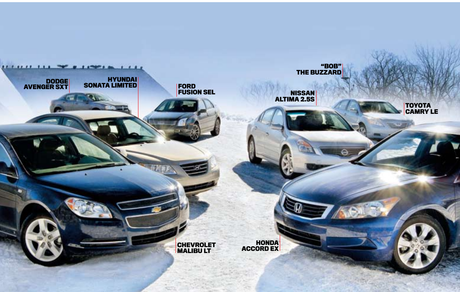
DODGE AVENGER SXT

As it turned out, the baloney theme was appropriate, because we were evaluating salt-of-the-earth