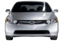
Alabaster Silver Metallic