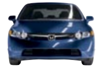
Royal Blue Pearl