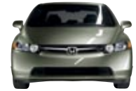
Green Tea Metallic