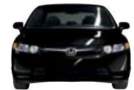
Nighthawk Black Pearl