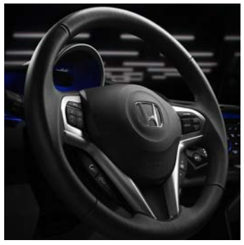
The thick, leather-wrapped 3-spoke steering wheel (EX) adds to the performance attitude of the interior. The combination of the tilt and telescopic steering column with the seat-height adjustment means you will undoubtedly find the perfect driving position.