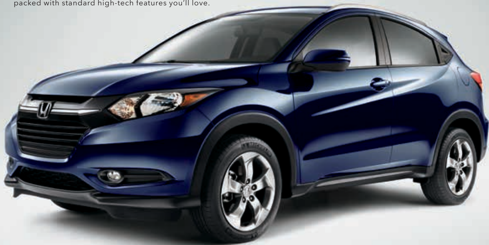
HR-V EX-L NAVI shown in Deep Ocean Pearl.

Introducing the all-new Honda HR-V Crossover. It's the perfect combination of advanced features, size and versatility, all in one extraordinary vehicle. The HR-V boasts three distinct interior configurations and it's packed with standard high-tech features you'll love.