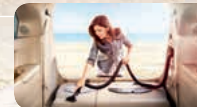
Odyssey Touring Elite shown in Obsidian Blue Pearl.

Its sleek, modern styling proves a minivan can be both practical and polished. Plus, it delivers groundbreaking technology that keeps you connected, and innovative conveniences that make life easier. Like the available HondaVAC, ® the first vacuum ever built into a minivan (Touring Elite ® ). And the Odyssey was the first minivan to earn the highest possible rating of "Good" from the IIHS in their small overlap front crash test. Its long list of safety features help make the Odyssey an IIHS 2015 TOP SAFETY PICK .