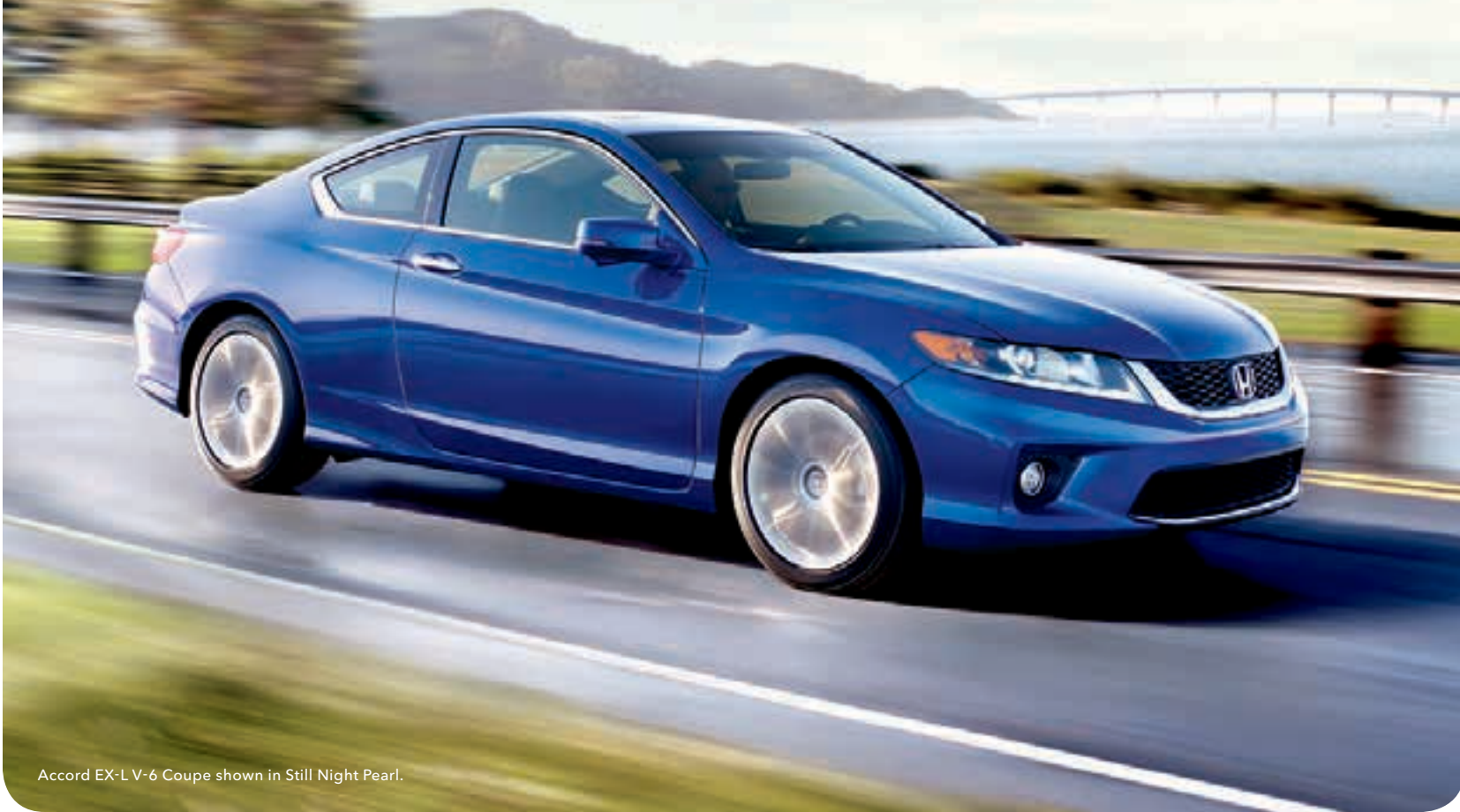
Accord EX-L V-6 Coupe shown in Still Night Pearl.