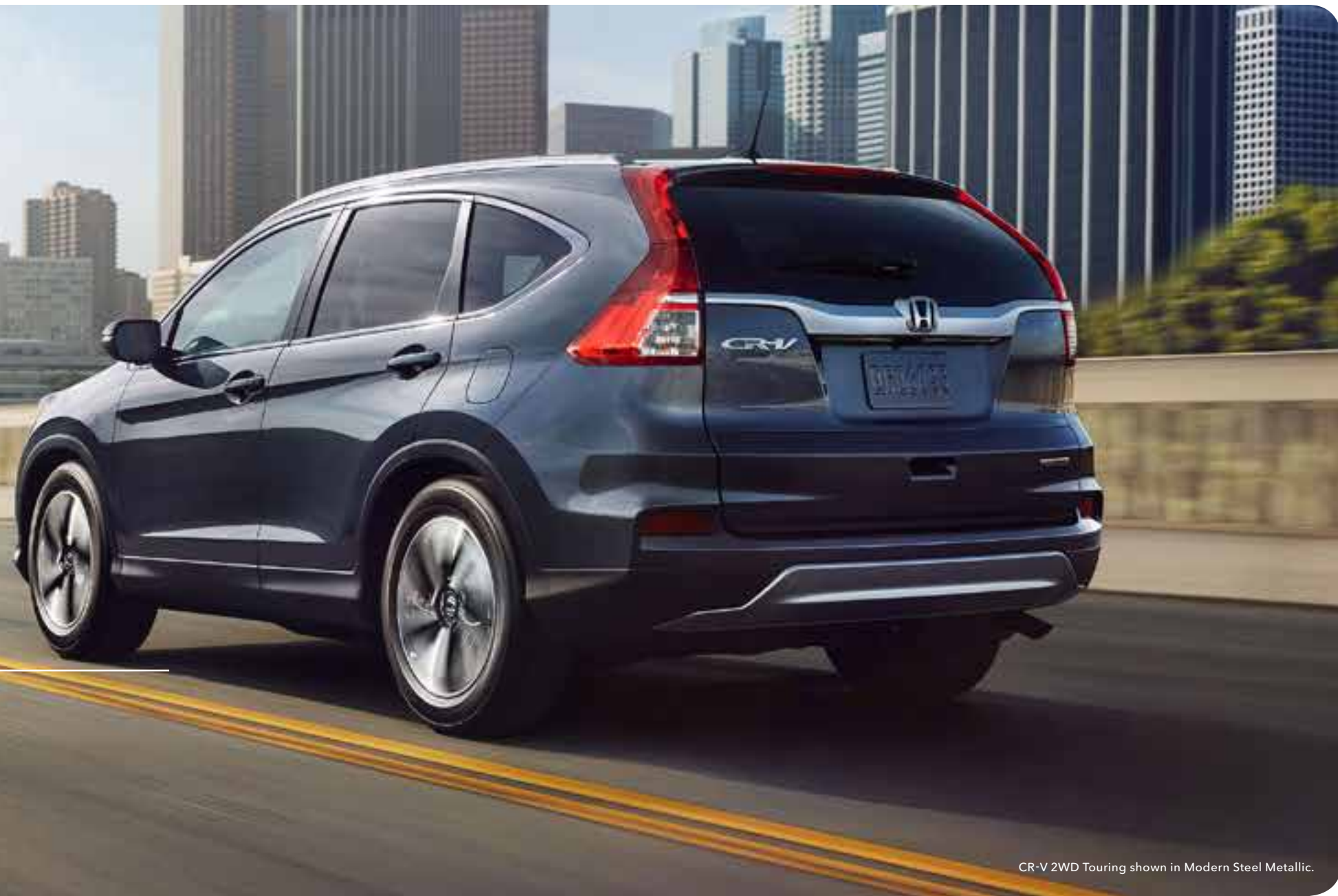
CR-V 2WD Touring shown in Modern Steel Metallic.

*27 city/34 highway/29 combined mpg rating for 2WD models. Based on 2015 EPA mileage ratings. Use for comparison purposes only. Your mileage will vary depending on how you drive and maintain your vehicle.